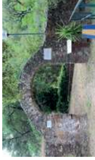
Entrance to the Fonte Férrea Leisure Park

Informations: Junta de Freguesia de Cachopo ☎️ +351 289 844 112