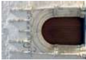
Gothic-Manueline portico of the old monastery of Nossa Senhora da Piedade