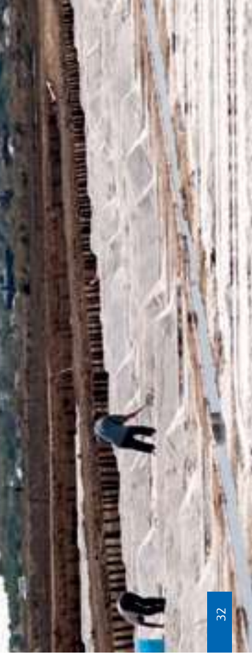
Salt pans (below)