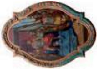
Painting of the Chapel of São Sebastião

reach the 12 old Monastery of Nossa Senhora da Piedade or das Bernardas (Our Lady of Piety or of the Bernardines). This building, founded by King Manuel I in 1509, features a side portico from that era; it has been altered several times and used for various purposes over the years. In 2012 it was restored and adapted for housing by the architect Souto Moura. If you look towards the ocean you will see the salt pans in the Ria Formosa Nature