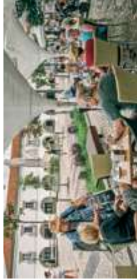
Praça da República

Return to the starting point at the Praça da República or take your time to enjoy a rest at one of the open-air cafes along the Rua José Pires Padinha or at the waterfront market.