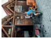
Fisherman repairing equipment

This church was expanded in June 2008. The architectural design for the expansion and remodelling of the space is based on the image of a boat in reference to the town's fishing activity. After this visit, turn right onto Rua Ormerindo