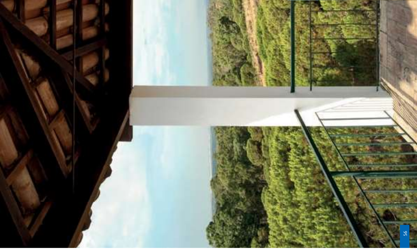
Serro alto (below)