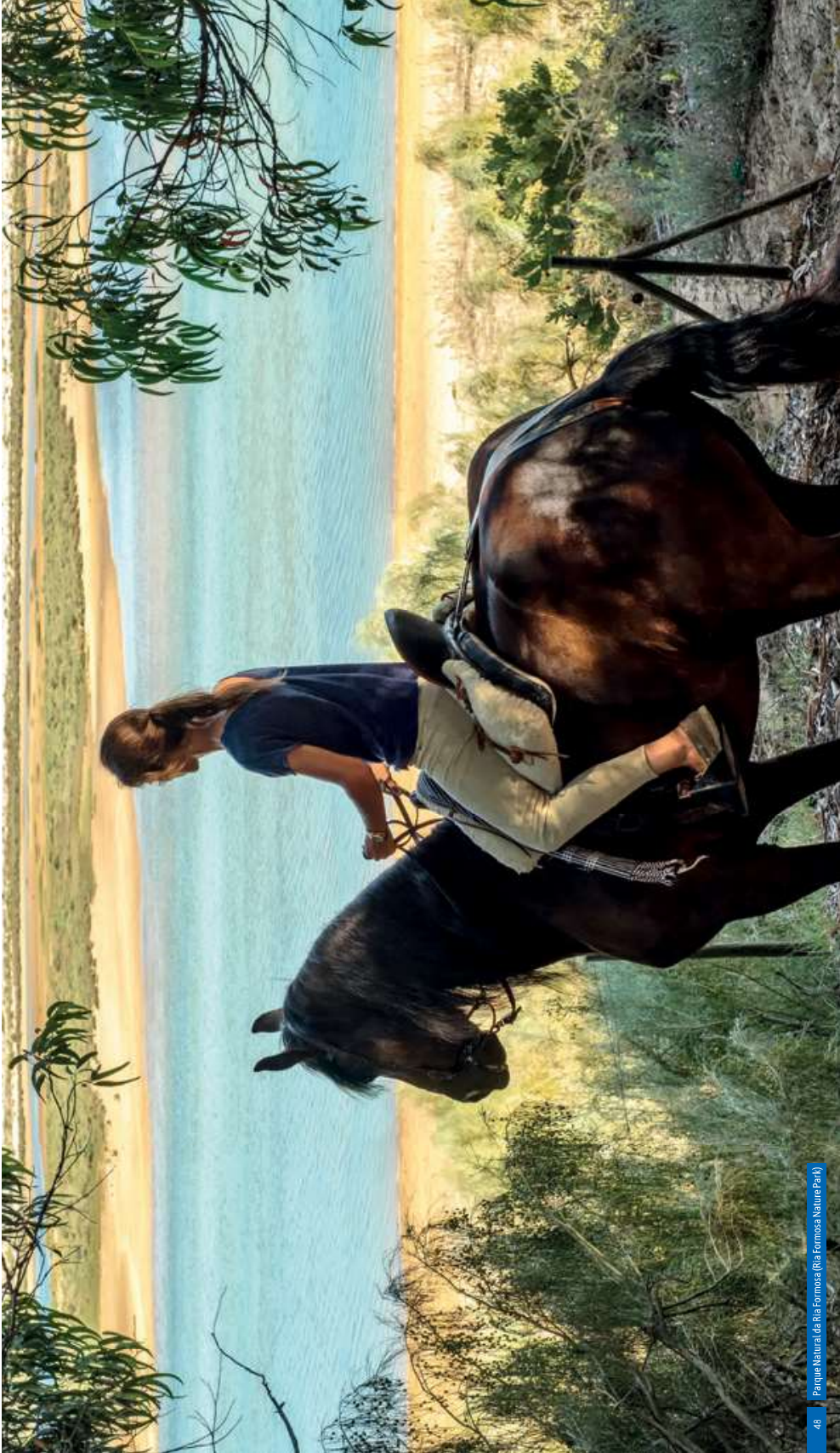
48 Parque Natural da Ria Formosa (Ria Formosa Nature Park)