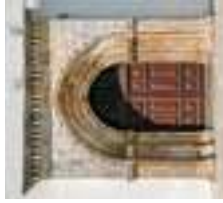
Door of the Main Church of Nossa Senhora da Conceição

The 40-hectare park has various species of trees and game animals, four small dams, a children's playground, toilets, a picnic area and four well-signposted trails.