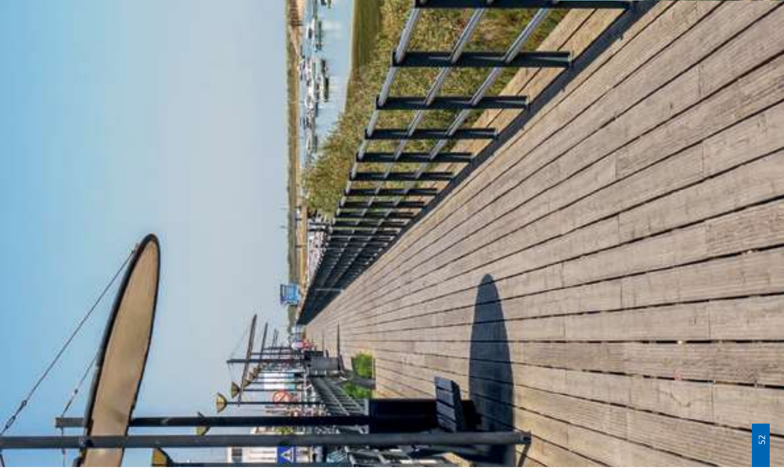
São João da Barra Fort